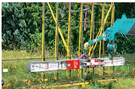
With a length of 2.16 m, the UPG450 is ideal for long, slim elements