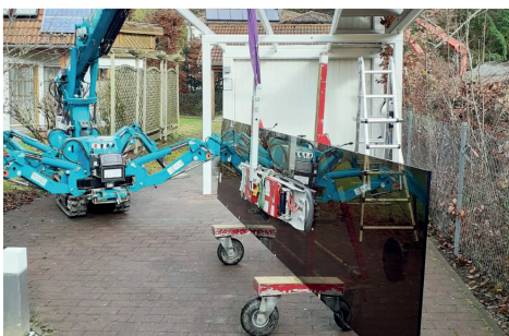
Use the UPT800 to transport the elements on the construction site