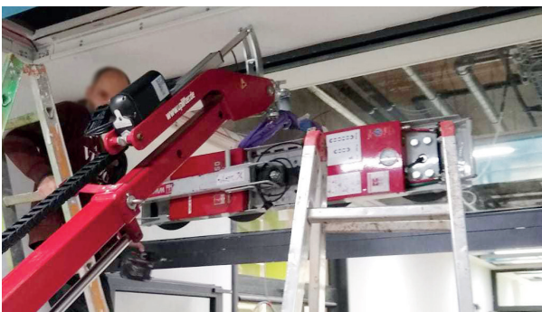
The lightweight, compact design ensures particularly flexible application options